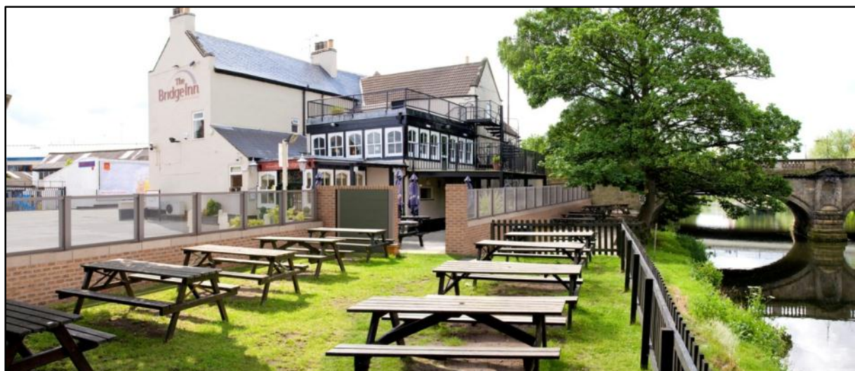
Figure 16.4: Visualisation of proposed flood wall at the Bridge Inn public house