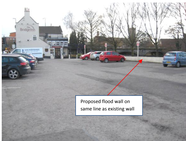
Figure 16.2: Flood wall at Bridge Inn public house car park