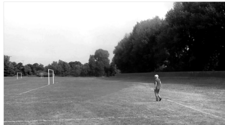
Walking along the North end of the old Roman Road.

Rain is now restoring the grass and we are very disappointed that Little Chester should lose this unusual opportunity. However we hope that should the chance come again we will be able to arrange flyover to reveal more of our fascinating and far distant past.